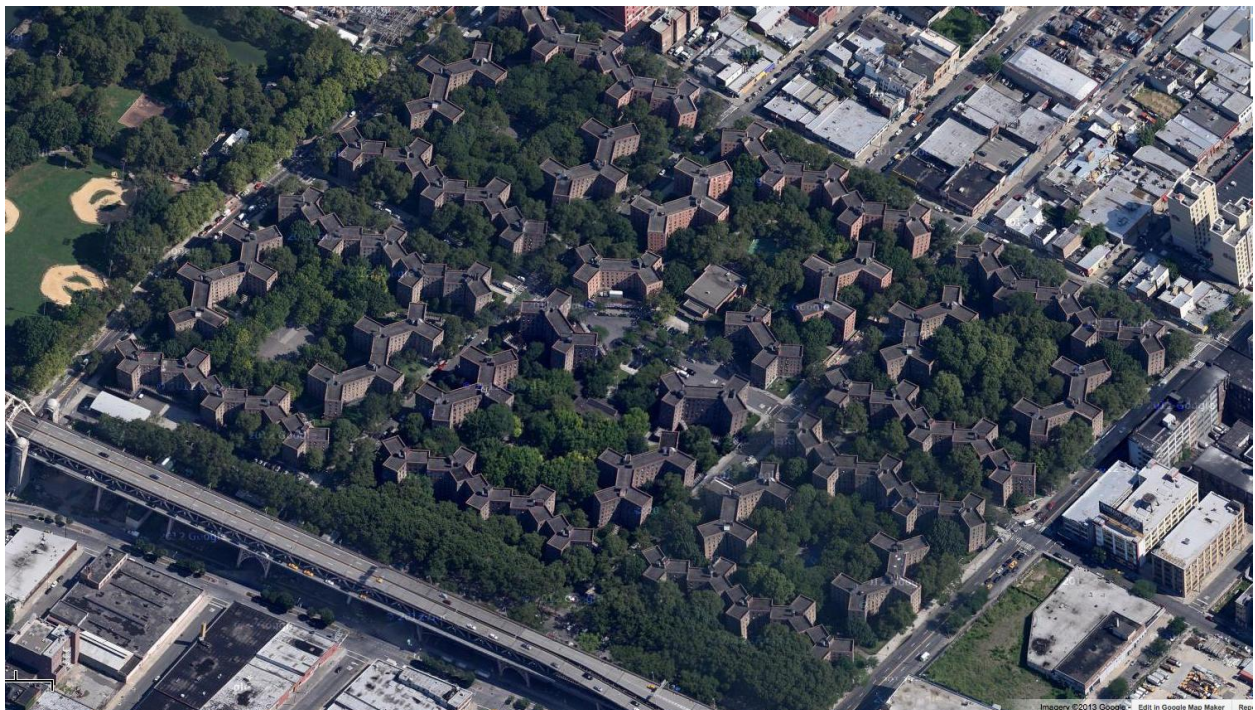
An aerial view of Queensbridge Houses